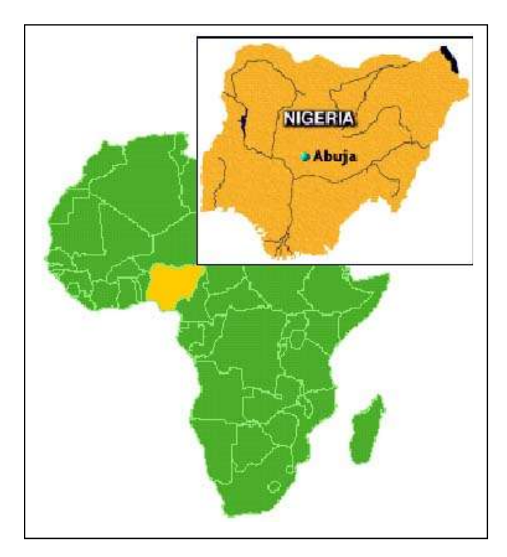
Figure 1. Location of Nigeria in African continent

Two principal wind patterns are observed in Nigeria. The Harmattan, from the northeast, is hot and dry. It most often carries reddish dust from the desert which causes high temperatures during the day and low temperatures at nights. The southwest wind brings cloudy and rainy weather.