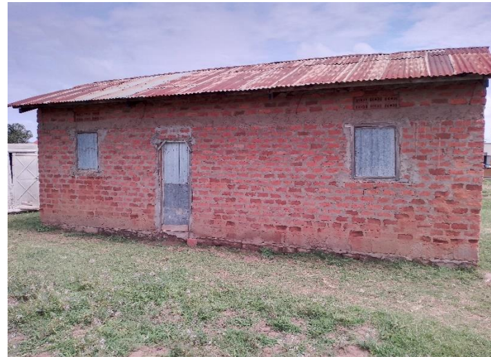
Northern side of building O