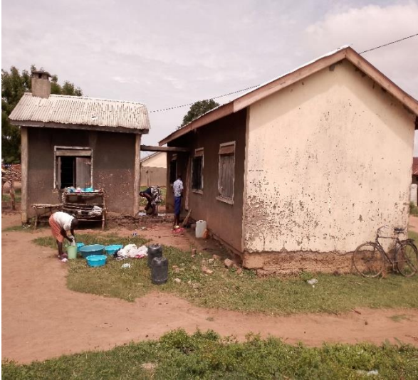
Eastern side of building K & L