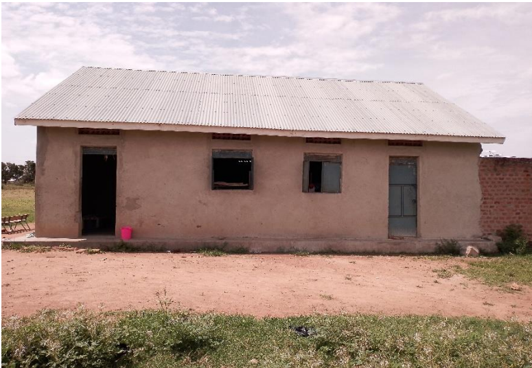
Northern side of building W