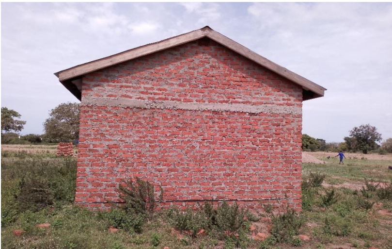
Eastern side of building Y