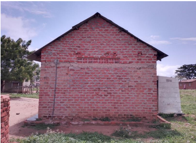
western side of building V