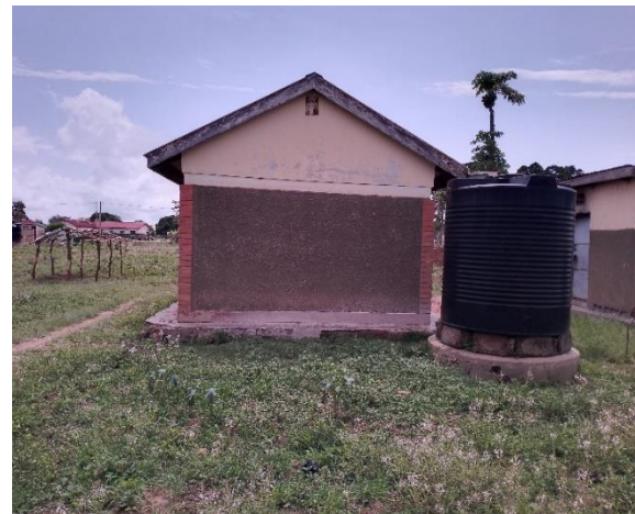
western side of building R.