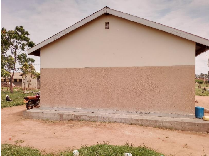
southern side of building M