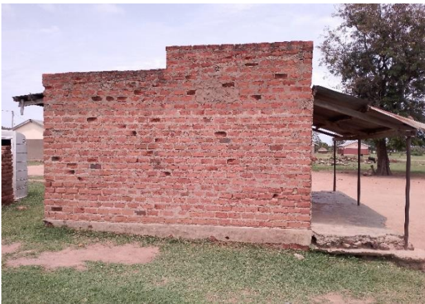
Eastern side of building A