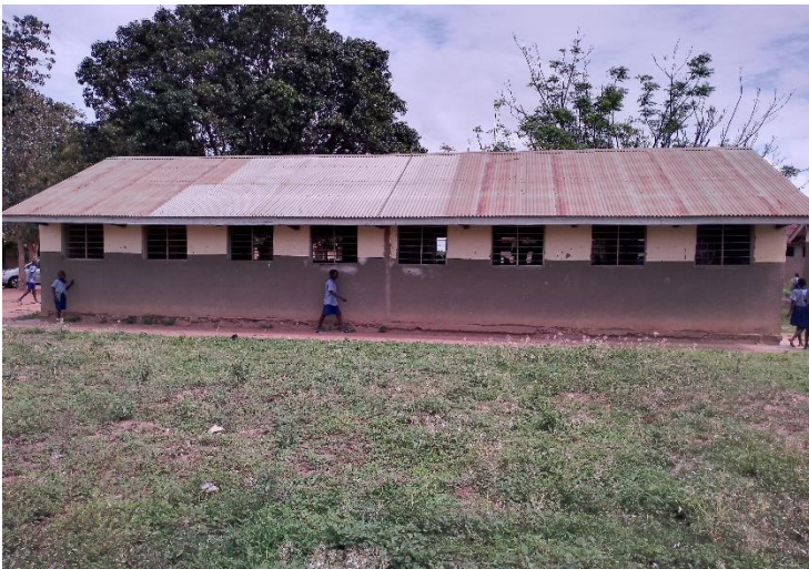
Southern side of Building I