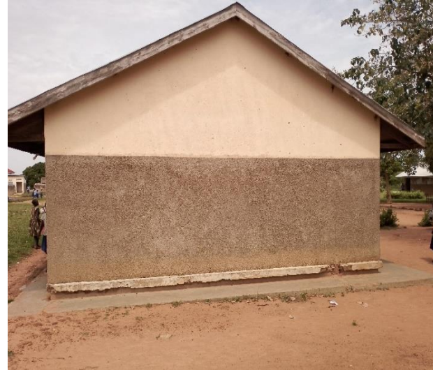
Western side of building H