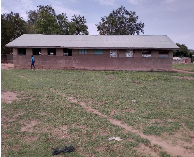
Northern side of building D