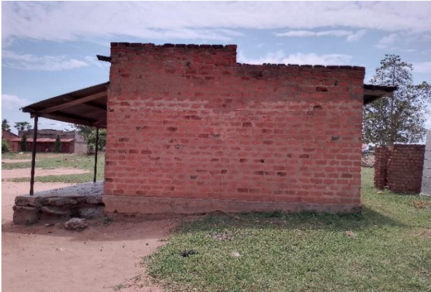
western side of building A (staff quarter)