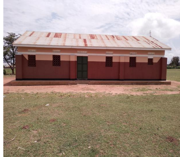
Southern side of building E