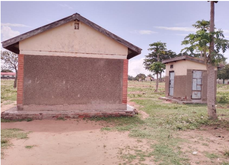
Western side of building P