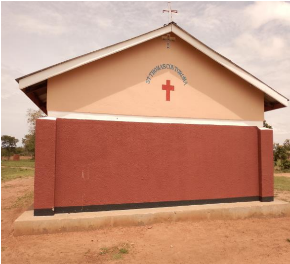
Eastern side of building E