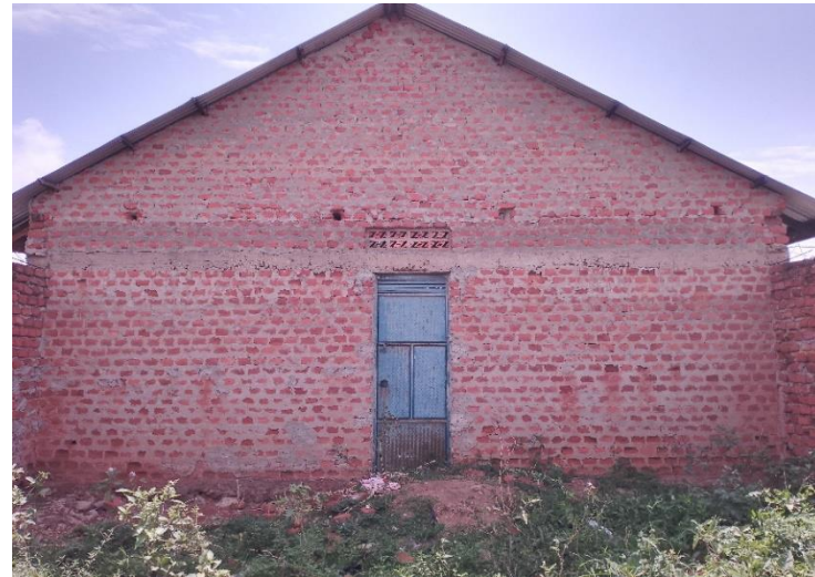
Western side of building W