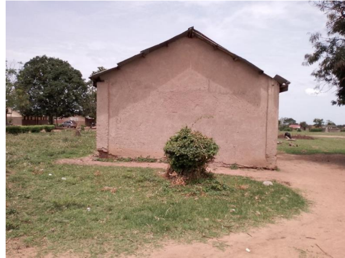
Eastern side of block B