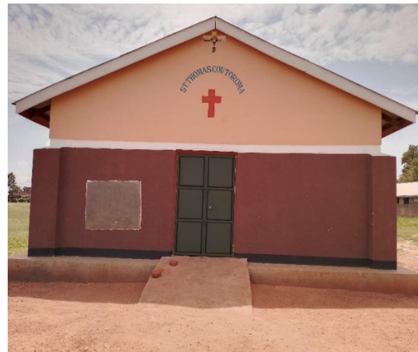
western side of building E (church)