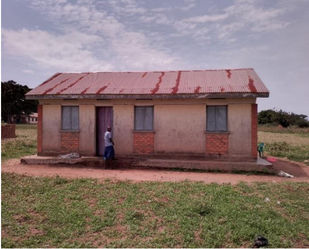
Northern side of buildings T, R, P