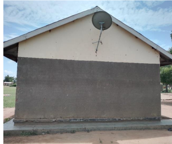
Western side of building C