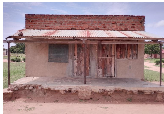
Northern side of building A