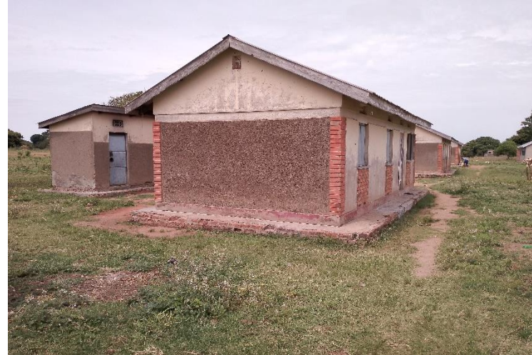
view of buildings P, R and T