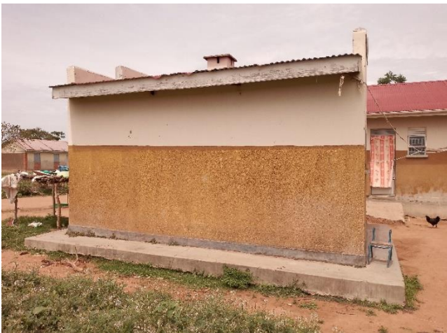
Eastern side of building N