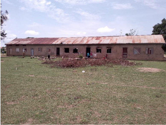
Northern side of block B