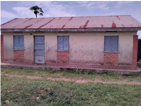
Northern side of building R