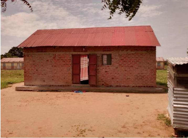
Northern side of building V