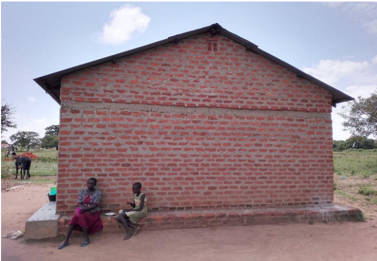
Western side of building Z