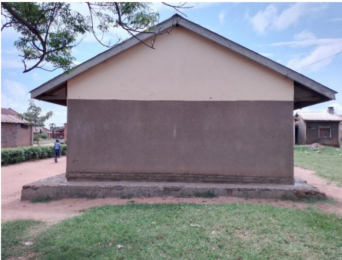
Western side of building J