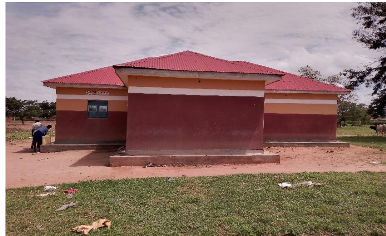
Southern side of building F