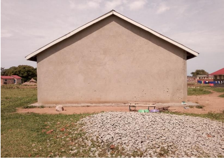
Eastern side of building W