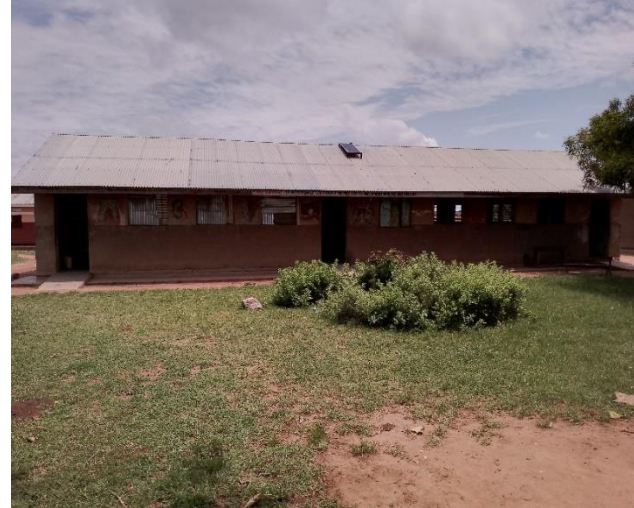
Southern side of building D