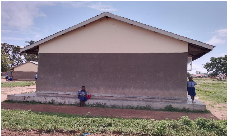
Western side of building X