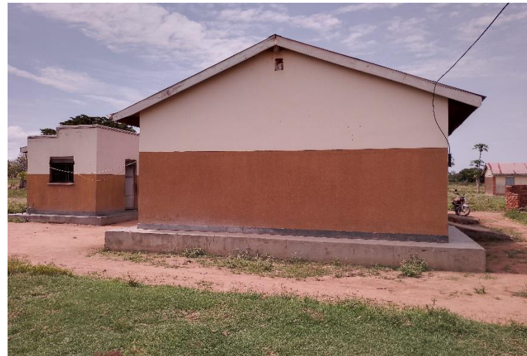
Northern side of building M