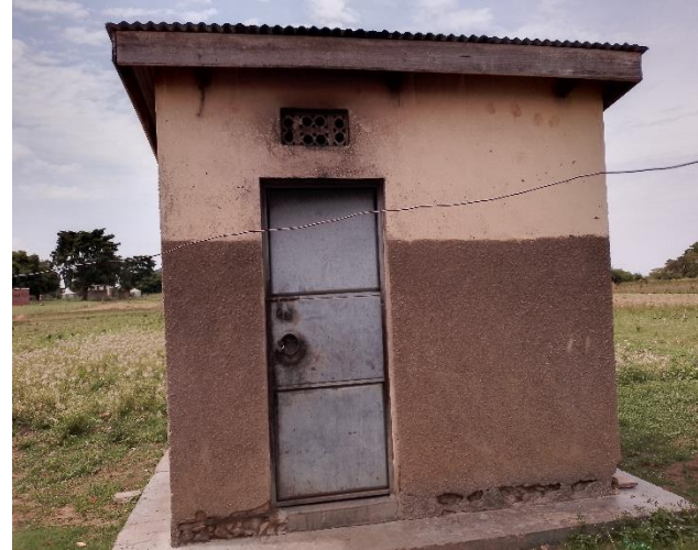
Northern side of building Q,S,U