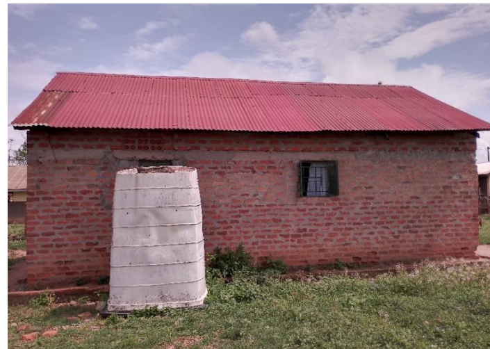
southern side of building V