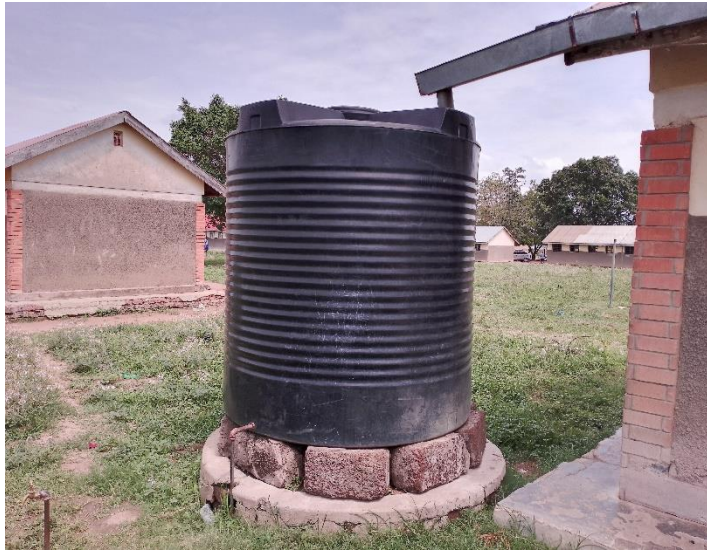
water tank on the western side of building R