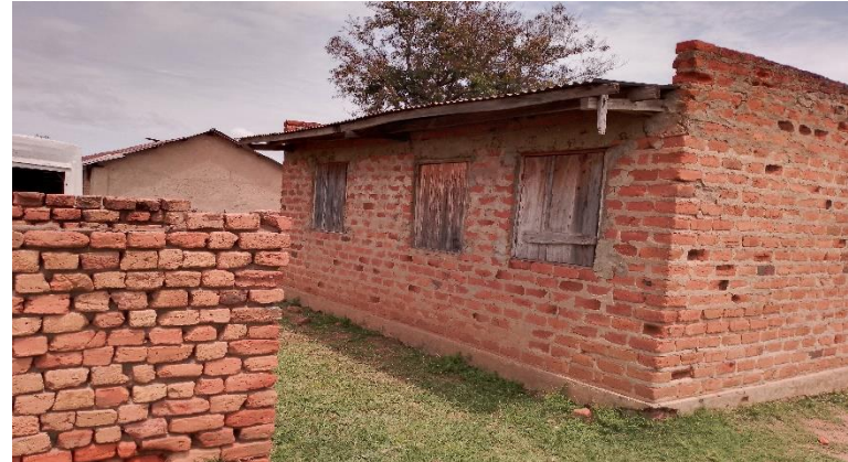
southern side of block A