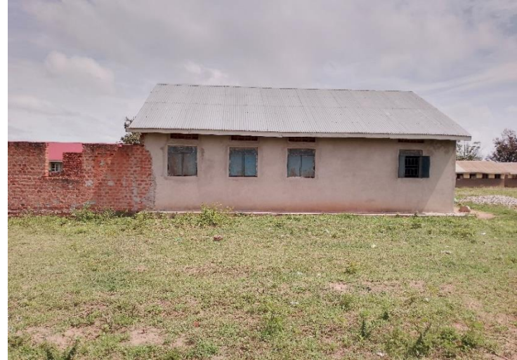
Southern side of building W