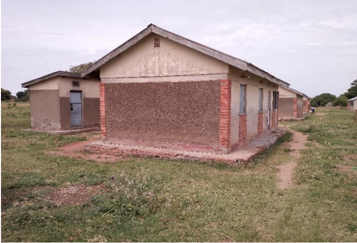
Eastern side of building P