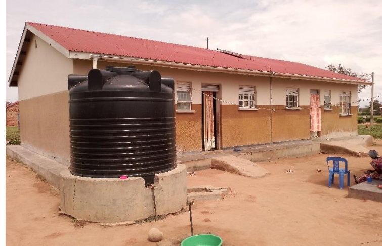
Eastern side of building M