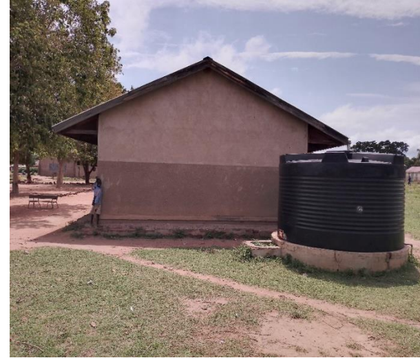
Western side of building G