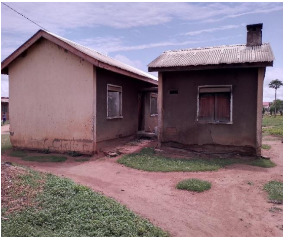
Western side of building K & L