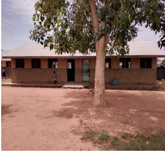
Northern side of building G