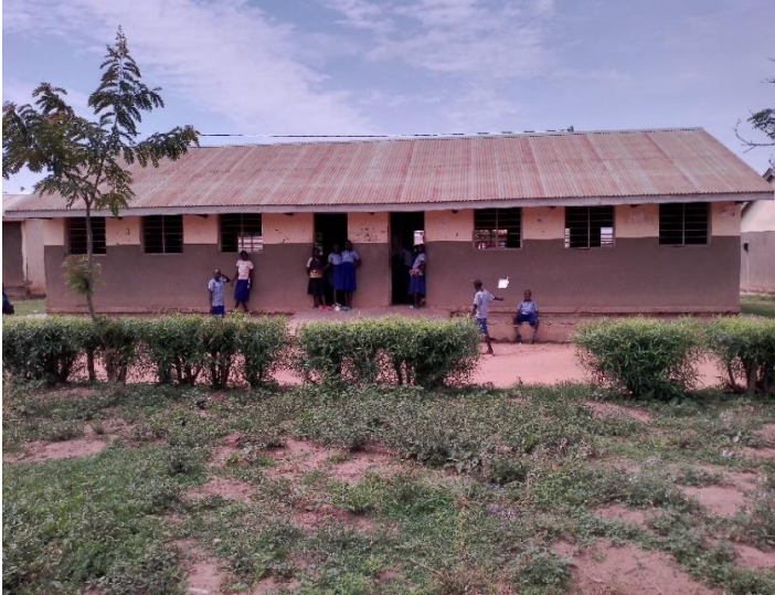
Northern side of buiding J