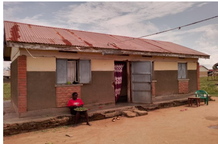
Southern side of building P