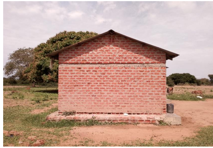
Eastern side of building Z