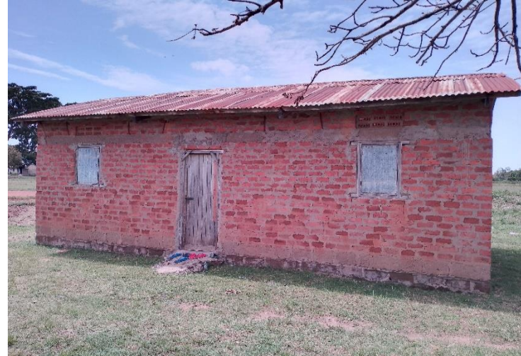
Southern side of building O