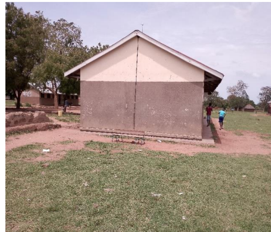
Eastern side of building C