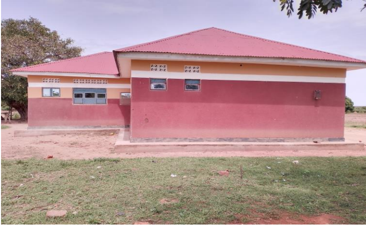
Northern side of building F