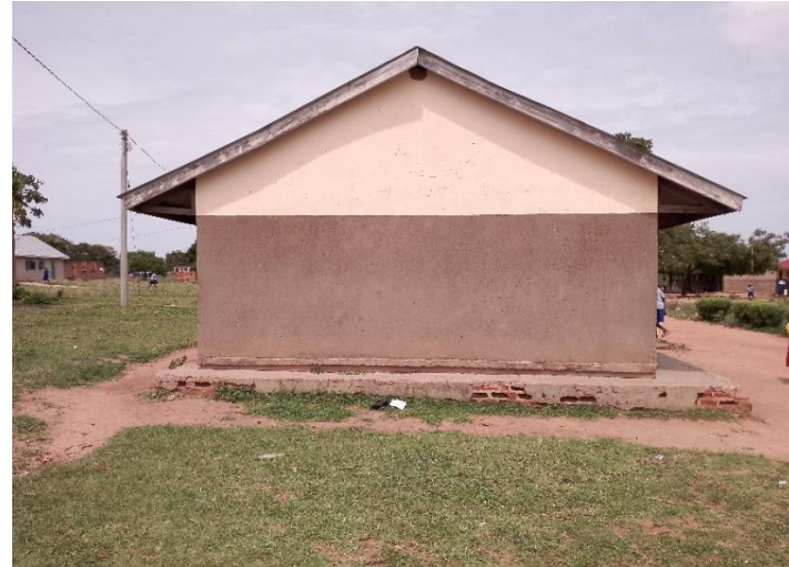
Eastern? (Southern) side of building J