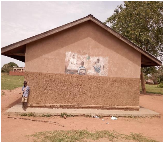
Eastern side of building G