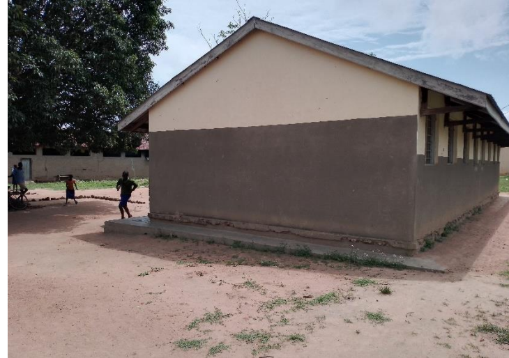
Western side of building I