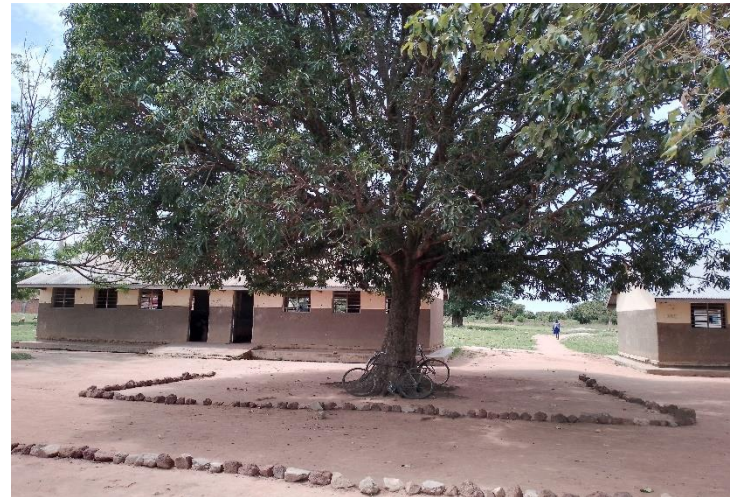
Northern side of building I