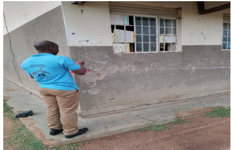
Eastern side of building X