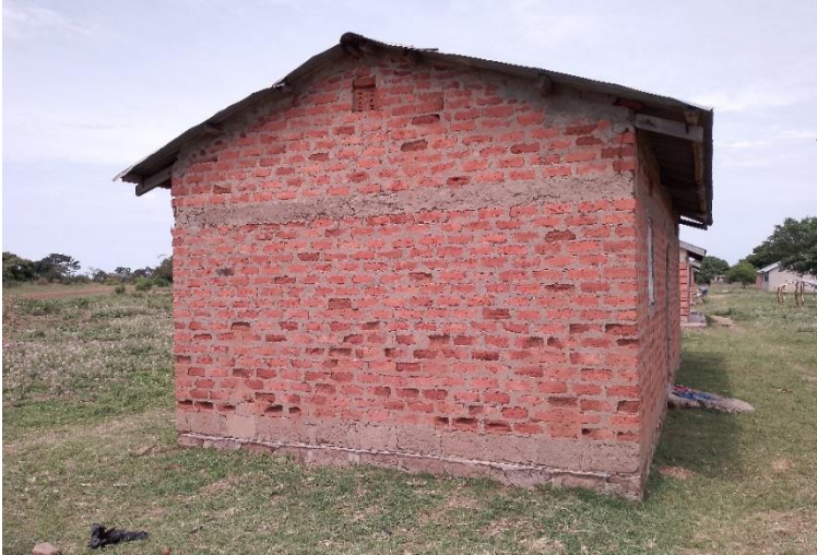
Eastern side of building O