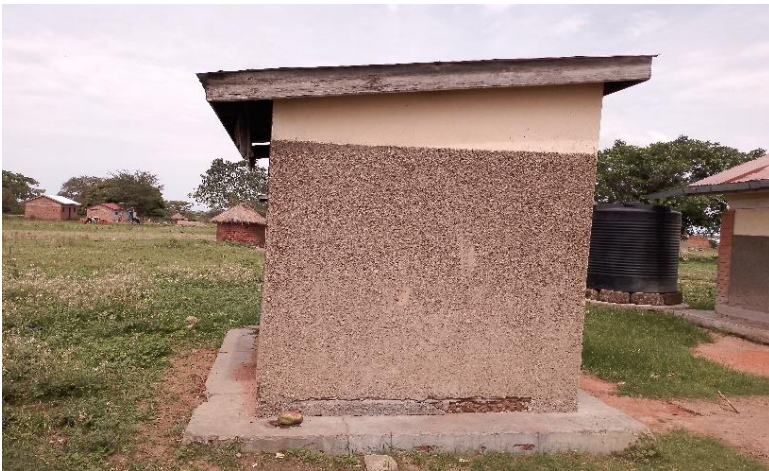
Eastern side of Buildings Q, S, U