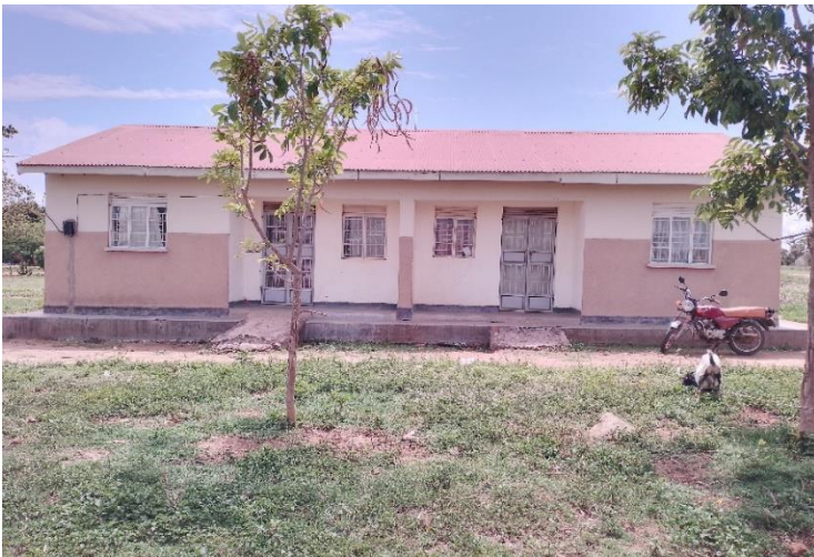
Western side of building M