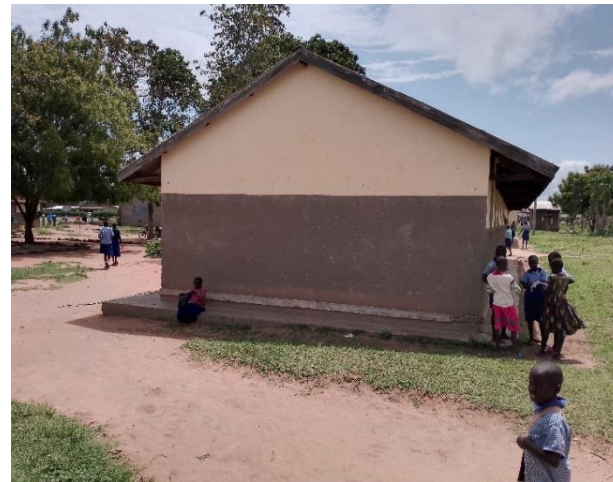
eastern side of building H