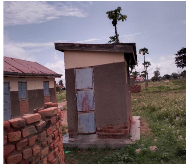
western side of buildings Q, S, U