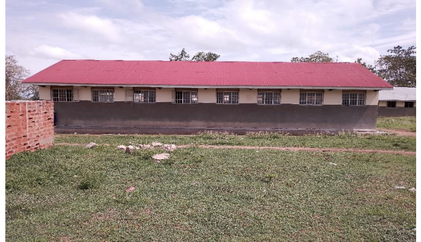
southern side of building X