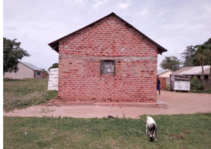
Eastern side of building V