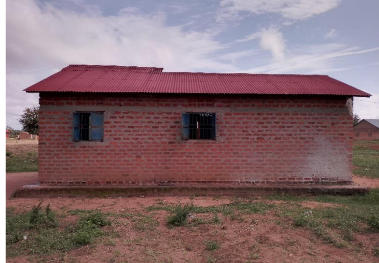
Southern side of building Z