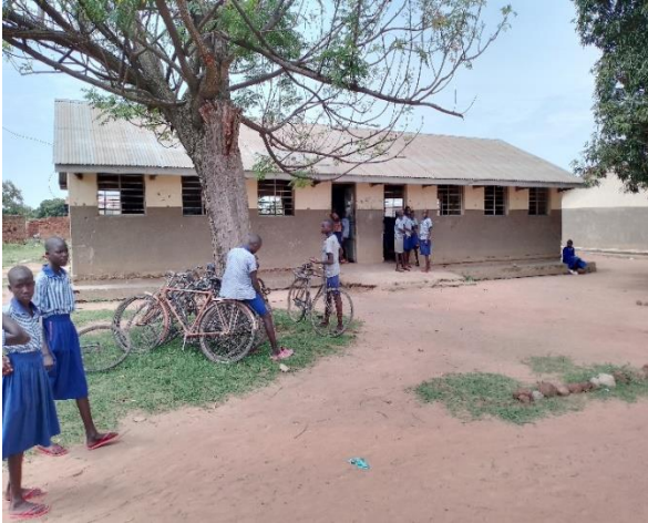
Northern side of building H