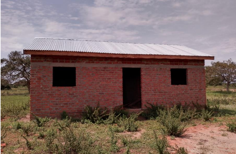
Northern side of building Y