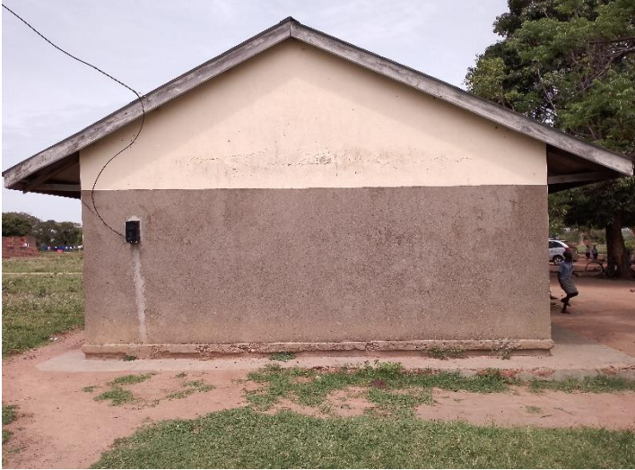
Eastern side of building I