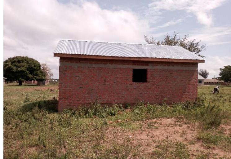
Southern side of building Y