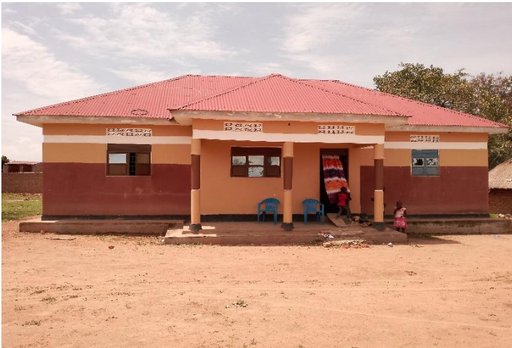
Northern side of building F (reverend home)