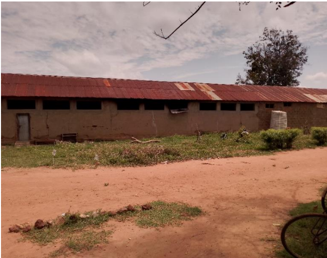
Southern side of block B