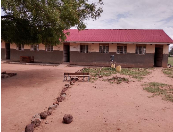
Southern side of building C