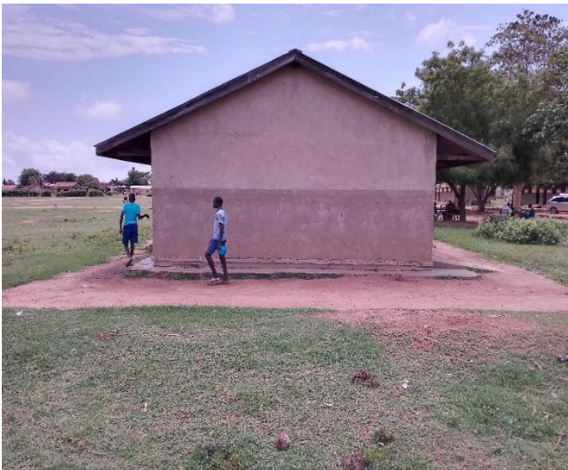
Western side of building D