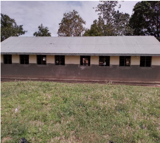
southern side of building H