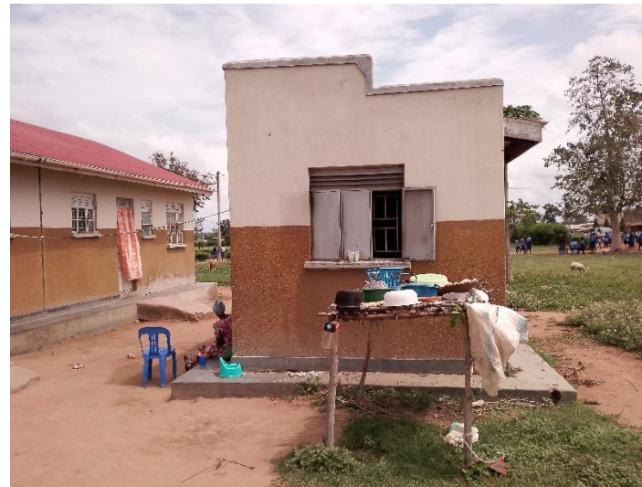
Southern side of building N