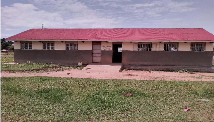
Northern side of building X