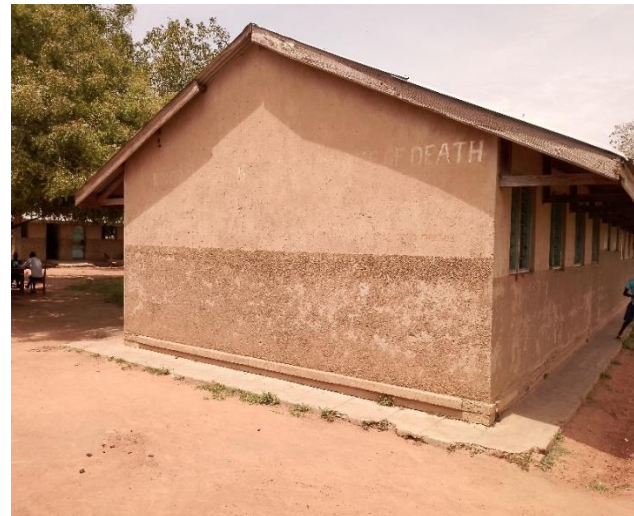
Eastern side of building D