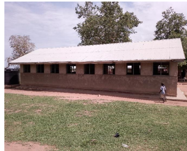
southern side of building G