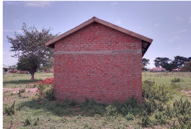
Western side of building Y