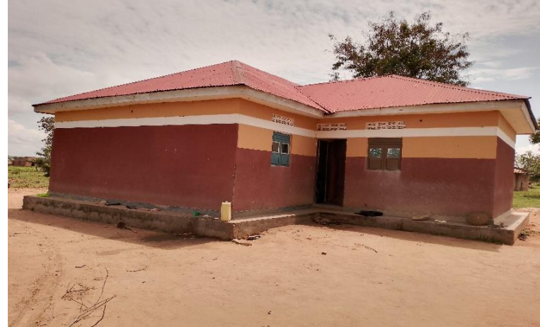
Eastern side of building F