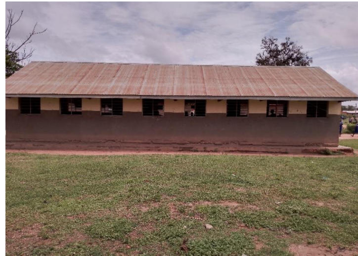
southern side of building J