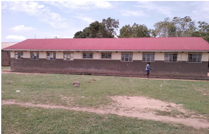
Northern side of building C