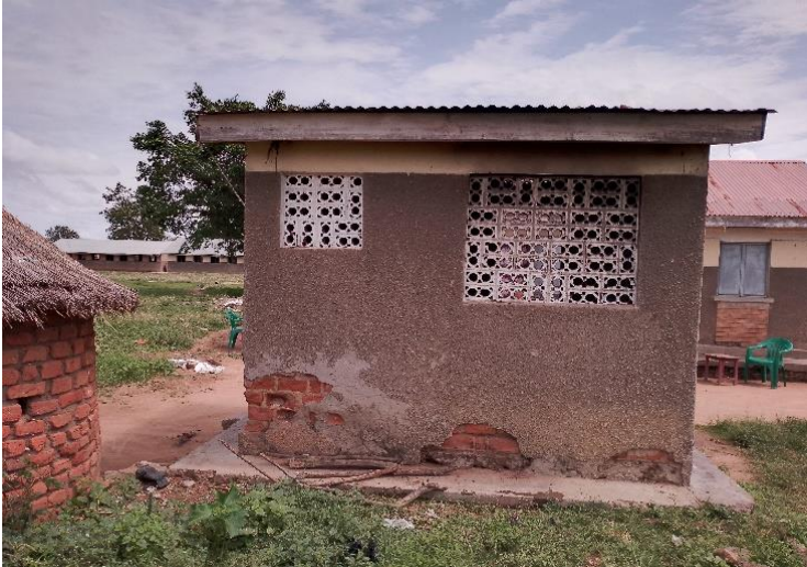
Southern side of buildings Q, S, U