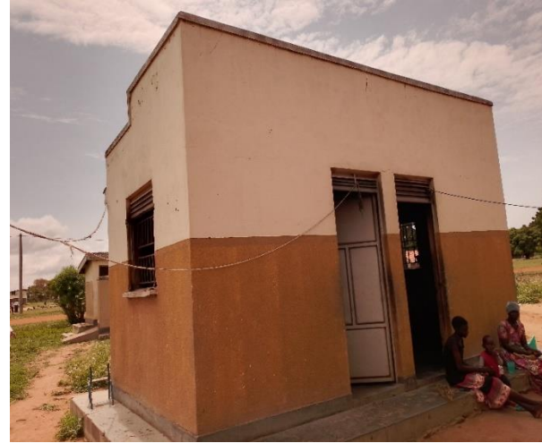
Western side of building N