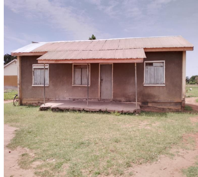
Northern side of building K