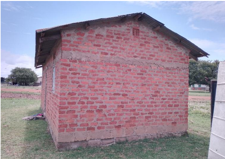
Western side of building O