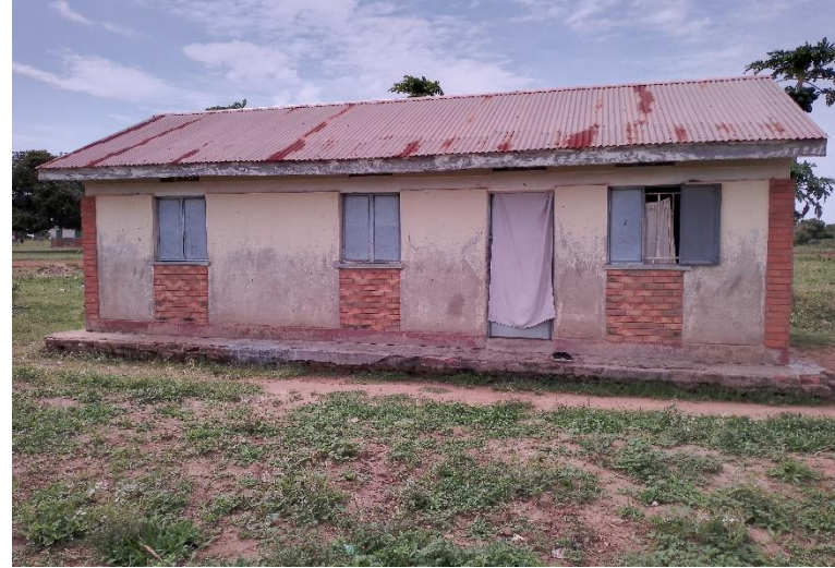
Northern side of building P