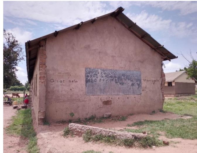
Western side of block B