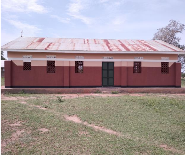
Northern side of building E