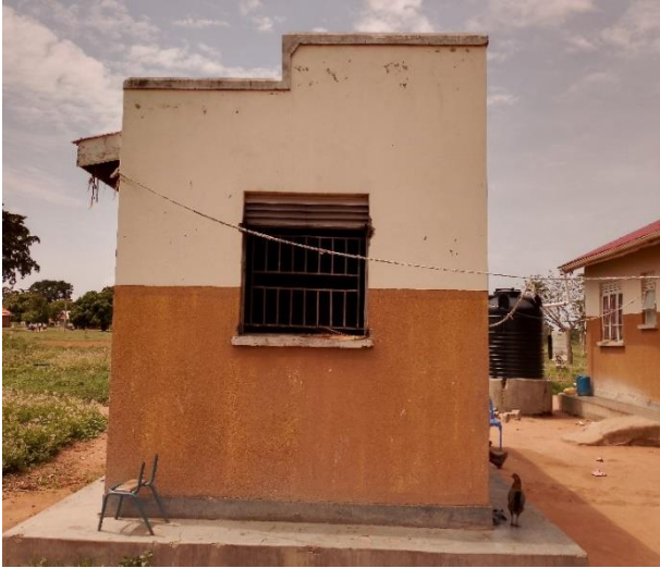
Northern side of building N