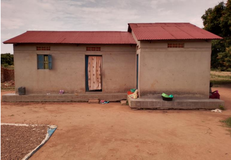
Northern side of building Z